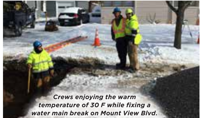
Crews enjoying the warm temperature of 30 F while fixing a water main break on Mount View Blvd.

Please remember just because the temperatures are warming up outside it is still cold underground. We are monitoring the temperatures of the distribution system to determine when we feel it is safe to shut them off. We will make contact by hanging a tag on the residence or a letter in the mail.