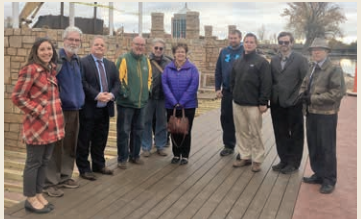
The Mayor and Council, along with partners and stakeholders tour the new public wharf now completed along the Wisconsin River.

There is a "Live Cam" of the East Riverfront Area on our website www.wausaudevelopment.com under tab Riverfront- check out the progress! Even better, the River's Edge Trail will be open and maintained all winter. Be sure to stop down and check out YOUR new waterfront!