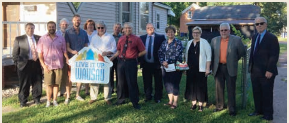
Mayor Mielke and Members of the City Council at the first Live It Up Wausau loan closing which helped a registered nurse purchase and renovate a historic home (circa 1907) in the City's near north neighborhood.

More information on Live It Up may be found at www.liveitupwausau.com . Nonprofit and tax deductible donations to support these loans for local employees can be made to the Community Foundation of North Central Wisconsin online at: www.cfoncw.org or by mail to: CFONCW attn: Live It Up Fund, 500 1st Street, Suite 2600, Wausau, WI 54403.