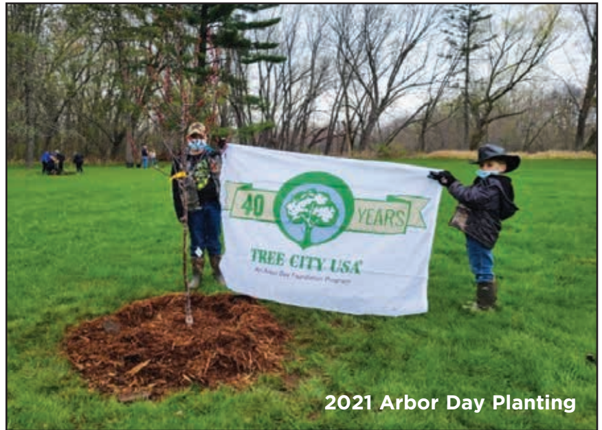
2021 Arbor Day Planting