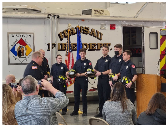
Our five recruits being sworn in signaling the end of the Recruit Academy.