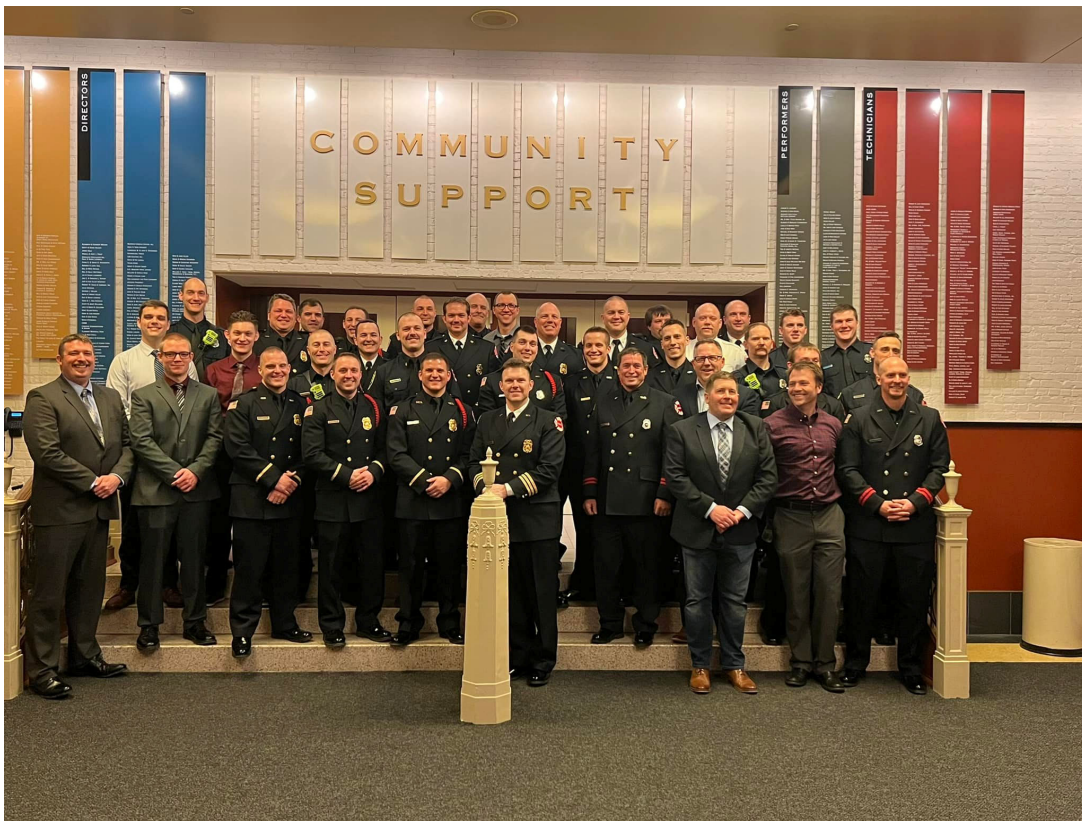
(WFD Members that were able to attend the 1 st Annual Firefighter's Banquet)