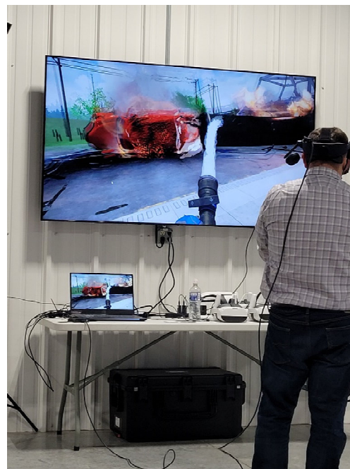
(GTI Director of Education and Training showcasing the available technology)