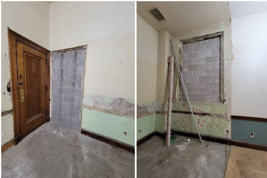
Permitted blocked in door and window of a downtown occupancy.

The crucial things we aim to identify while performing walk-throughs are building modifications to doors, windows, and/or structure, as well as fire suppression concerns. Most changes are often permitted and approved by engineers. However, some owners or occupants modify buildings in a manner that is not approved and can put residents and rescuers at risk. This specific case is approved, but if someone was used to an exit being there, and now it is gone, it may pose an issue.