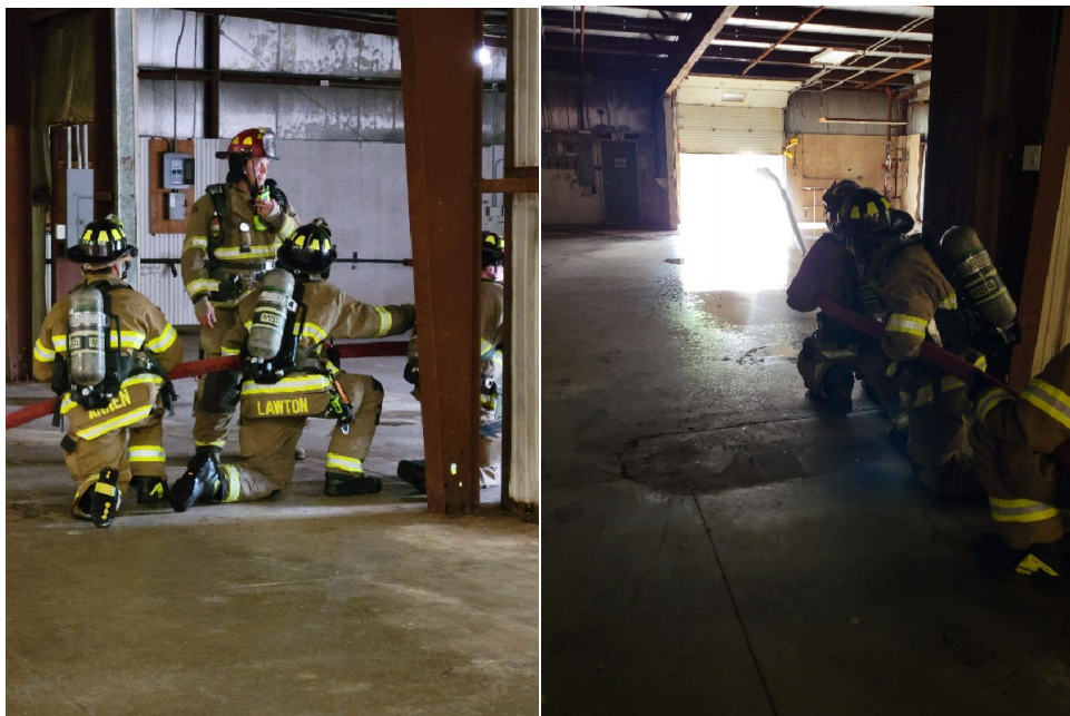
2 ½" hose deployment in a commercial structure.

Firefighters are constantly training on various disciplines. We must always ensure we cover the basics. Here, a fire company is training on deploying a 2 ½" hoseline in a commercial structure. While this task appears easy, it is physically taxing to drag a charged hoseline from the engine, into a building, with will PPE.