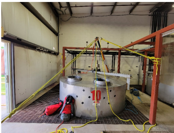
"Gin-pole" created with a leg of our TerrAdaptor tri-pod kit.

Throughout the year, our training plan provides structure to ensure we cover required and specialty training. The crew officers and members often pose challenges to each other to assess readiness or build critical thinking ability before it is faced on a scene. The below scenario was posed by a Lieutenant to his rescue crew to create a "mono-pod" or "gin-pole" as a high point anchor for confined space. While this is not a frequent occurrence, it tested the crew's knowledge of rope rescue, confined space rescue, physics, and geometry. Although the members on the rescue had not trained on this type of anchor, they were able to construct the anchor in an efficient means that displayed a working knowledge of the concepts while being monitored for safe practices.