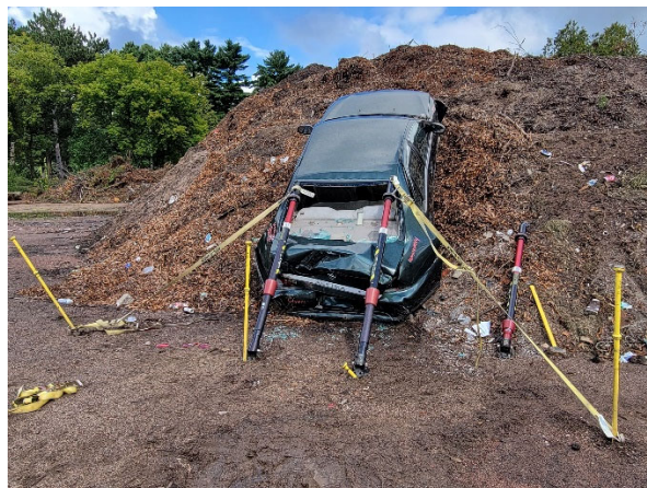
Multiple vehicle extrication scenarios.