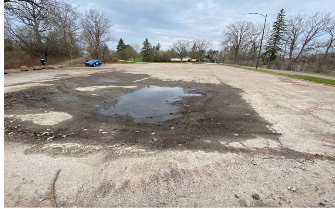
Riverside Park Parking Lot