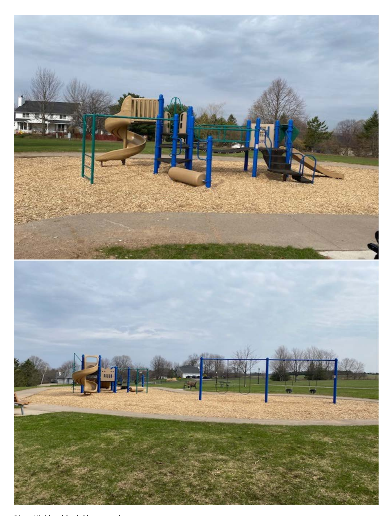
River Highland Park Playground