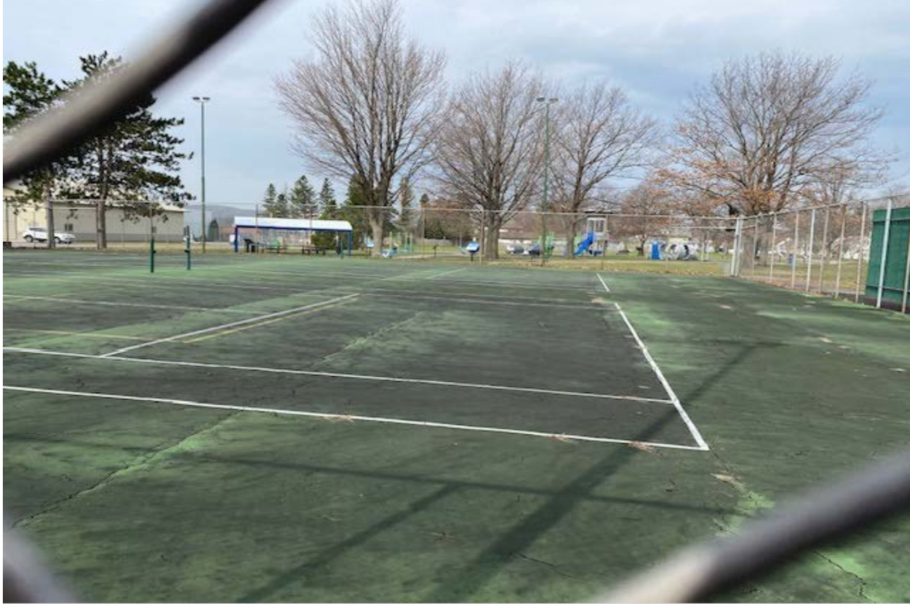
Alexander Airport Park Tennis Court